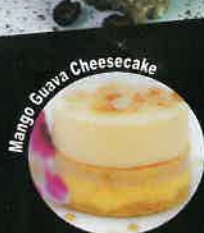
Mango Guava Cheesecake