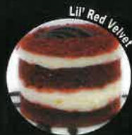
Lil' Red Velvet