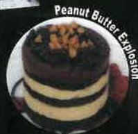
Peanut Butter Explosion