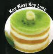
Key West Key Lime