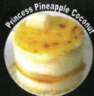
Princess Pineapple Coconut