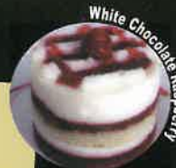
White Chocolate Raspberry