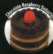
Chocolate Raspberry Seduction