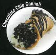
Chocolate Chip Cannoli